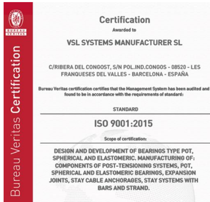
Figure 1. ISO 9001 certification.