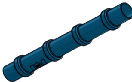
Figure 2. PT-PLUS 22 duct.

Product description: This EPD covers the life-cycle analysis of the PT-PLUS 22 duct for mono-strand anchorage systems. The PT-PLUS 22 duct connects with anchorages mono-strand S 6-1 standard and S 6-1 Plus type, though plastic parts (T- connection nozzles). All these elements conform a lightweight post-tensioning system to improve the strength of construction elements such as concrete slabs.